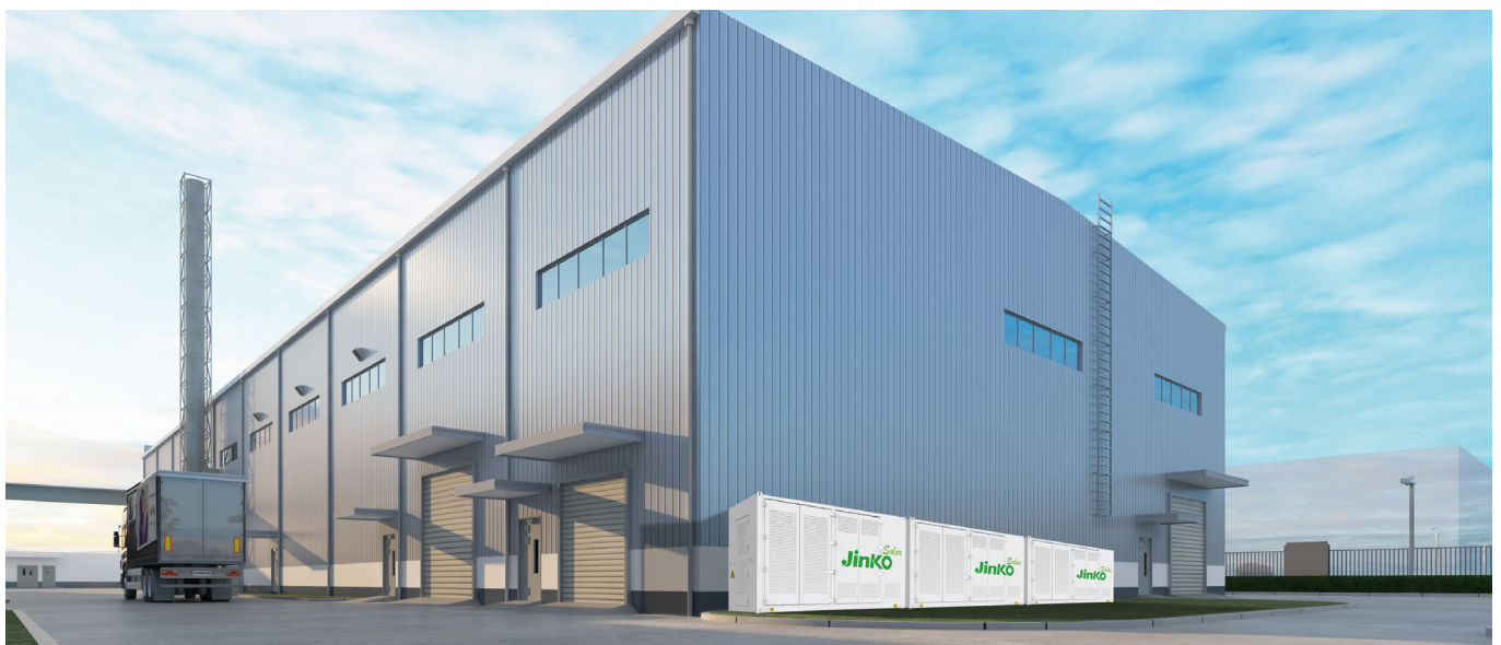
Figure 1: Project Photos

In addition to standalone operation in off-grid mode for power backup, Jinkosolar's C&I ESS provides peak shaving for demand charge management, load shifting for time-of-use savings.